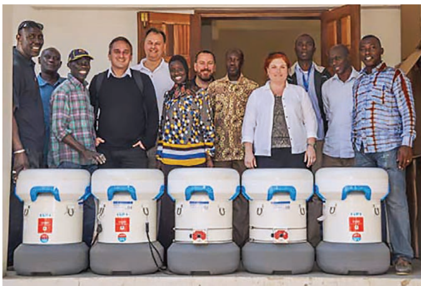
FIGURE 1. The Intellectual Ventures team and aid workers with the PVSDs designed to carry vaccines during a field study.

“Global Good’s researchers used experimentation along with thermal and vacuum system modeling with COMSOL Multiphysics in order to identify materials and designs that would allow the PVSD to maintain high vacuum levels at high temperatures.”